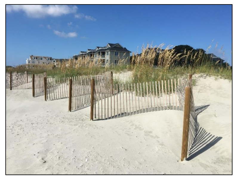
Figure 4. Sand fencing and dune vegetation at Isle of Palms, SC.