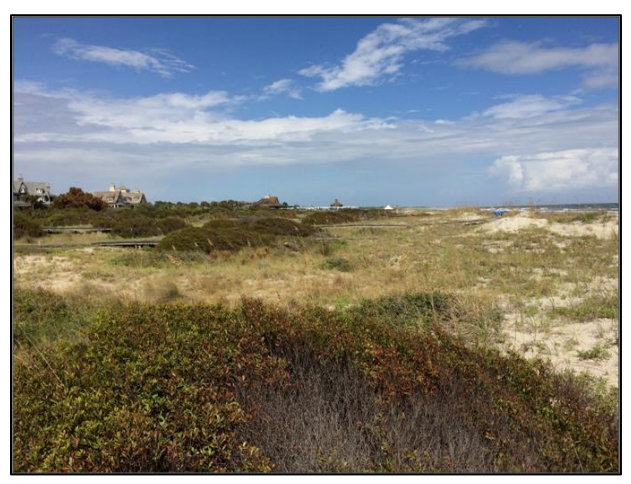
Figure 3. Dune hummock at Folly Beach, SC (top left); Dune ridge at Hunting Island, SC (top right); Dune field at Kiawah Island, SC (center).

As the wind blows across a dry sand beach, it moves sand particles until the wind speed decreases and the sand deposits on the beach or the wind encounters an object that causes the sand to deposit on the beach. Dune vegetation and sand fencing are both effective dune builders because they cause windblown sand to deposit and accumulate (Figure 4). Dune vegetation is particularly effective because the foliage of the plants causes the sand to build up above the surface of the dune while the root systems of the plants hold the sand together beneath the surface. Unvegetated sand is more easily eroded by waves than vegetated sand because the unvegetated sand has no plant roots to bind the sand together.