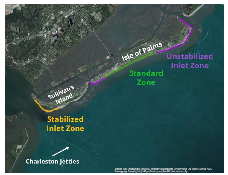
Figure 1. Designated beach zones for Sullivan's Island and Isle of Palms, SC.

In standard zones, which are not influenced by inlet dynamics, the baseline is established at the location of the crest of the primary oceanfront sand dune. In standard erosion zones in which the shoreline has been altered naturally or artificially by the construction of erosion control devices, the baseline must be established by DHEC OCRM using the best scientific and historical data, to determine where the crest of the primary oceanfront sand dune for that zone would be located if the shoreline had not been altered (S.C. Code of Laws § 48-39-280(A)(1)). In standard zones where there is no natural primary dune, the baseline location can be determined based on existing natural dunes in the area. An average or "ideal" dune is then calculated and superimposed on beaches without natural dunes (S.C. Code Ann. Regs. 30-21(H)(2)).